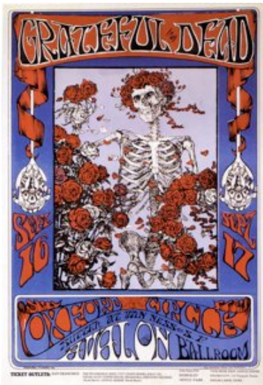
The Grateful Dead's "Skeleton and Roses" poster by Stanley Mouse and Alton Kelley; the story behind which, is revealed in "American Artifact"